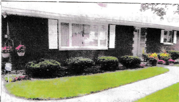
July: 3310 Northside Blvd