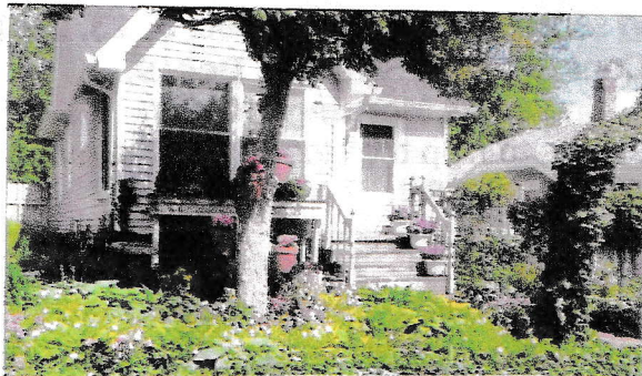
May: 746 S. 30 th

Here are the Lavish Lawn Awards for 2017: