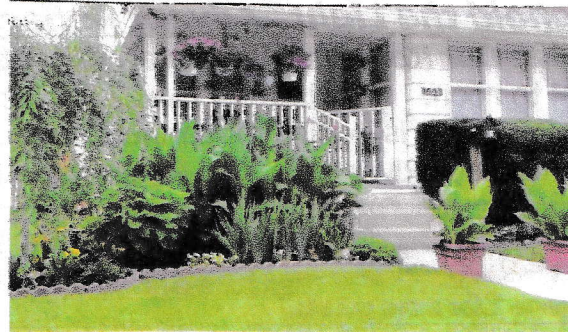
June: 753 S. 33rd