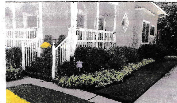
August: 701 S. Ironwood